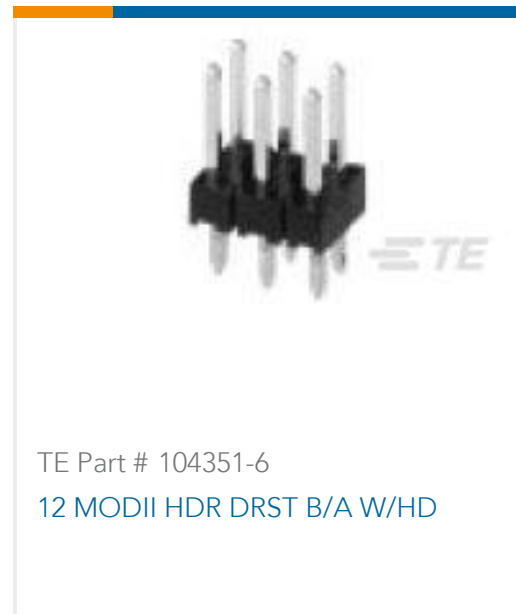
TE Part # 104351-6 12 MODII HDR DRST B/A W/HD