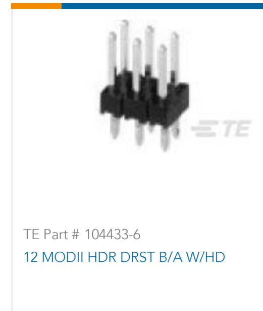
TE Part # 104433-6 12 MODII HDR DRST B/A W/HD