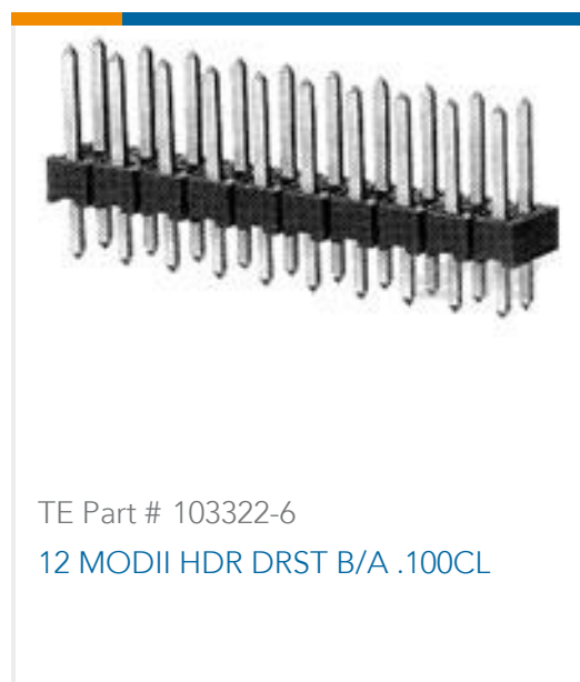
TE Part # 103322-6 12 MODII HDR DRST B/A .100CL