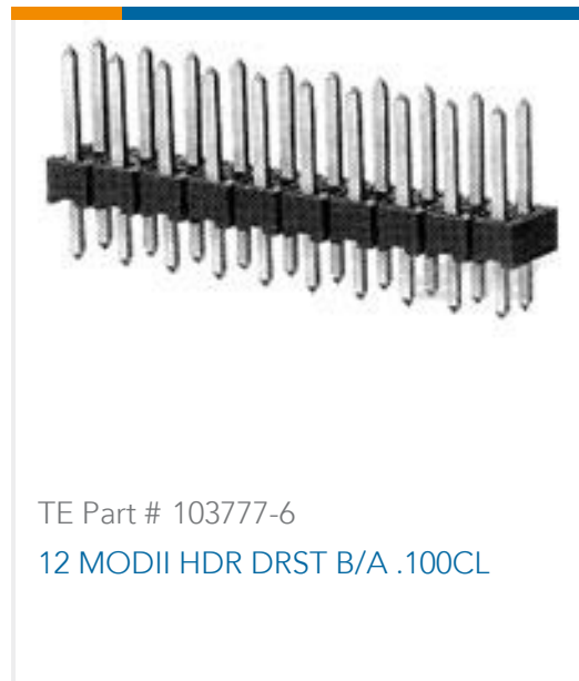
TE Part # 103777-6 12 MODII HDR DRST B/A .100CL