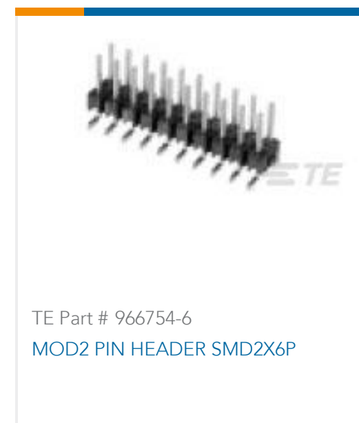
TE Part # 966754-6 MOD2 PIN HEADER SMD2X6P